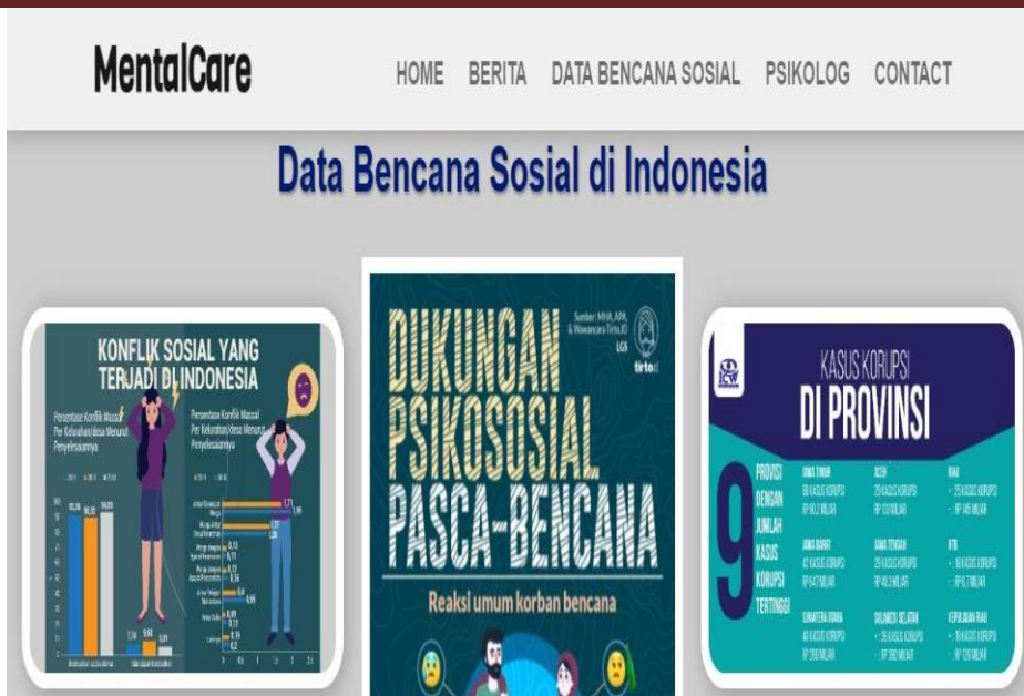
Figure 4: Interface of Social Disaster Data Feature