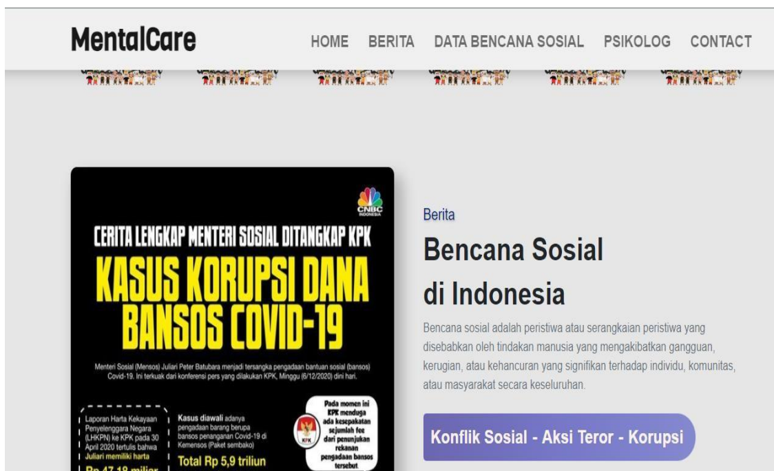
Figure 3: Interface of Social Disaster News Feature